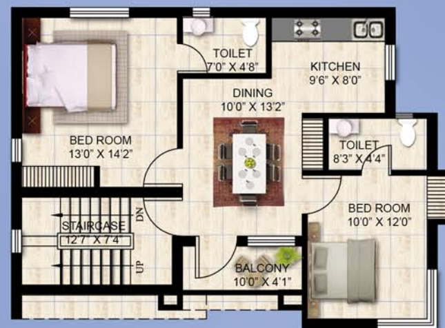
FIRST FLOOR PLAN 968 Sft.